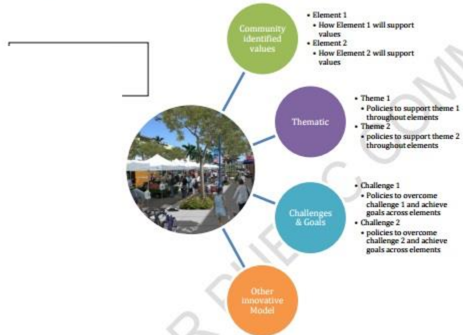
Figure 1: Examples of General Plan Layout

“The advantages of combining elements are many: internal consistency is easier to achieve; functionally related goals, objectives, and policies can be grouped together for easier reference; redundancy is minimized; and the general plan text can be held to a reasonable length, making the plan both easier to understand and easier to implement.”